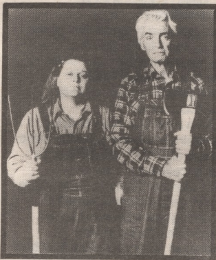
Kylie and Jason without the SPACE MASKS they normally wear, but, strangely with the dungarees.

Lemmy hitches up his belt (oof), straps on his axe and roars into the black leather spikey mic. "FURGHWURRRGHURRI! ACE