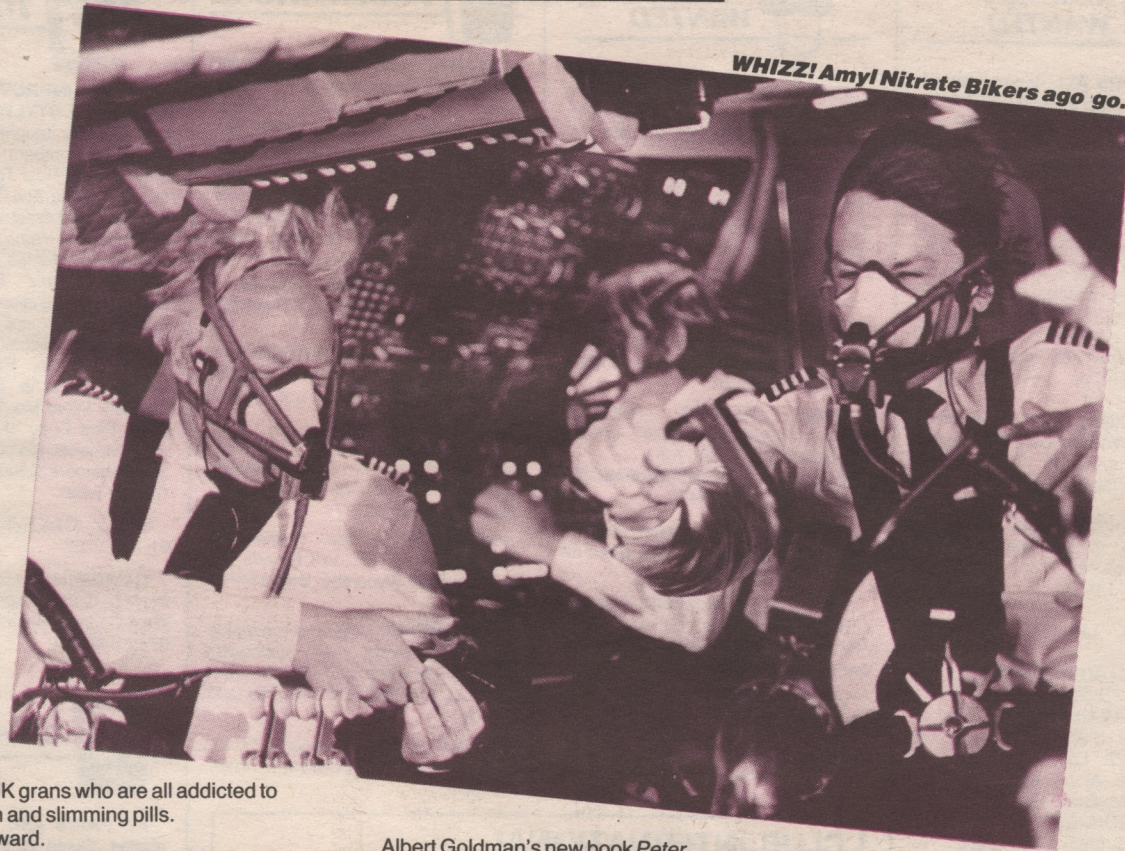
WHIZZ! Amyl Nitrate Bikers ago go.

T HE FUTURE'S SO BRIGHT YOU GOTTA WEAR FLARES!!!!!! W-W-W-W-WATCH IT! THE 1990s ARE COMING!